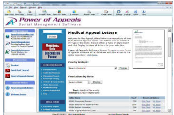
Choose from over 1600 professionally written appeal letter templates